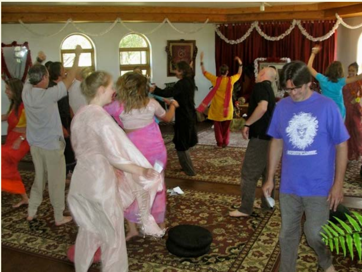
Lots of Visitors to the Ashram