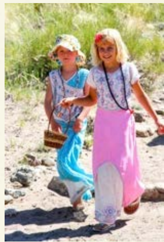
We ended this year on the